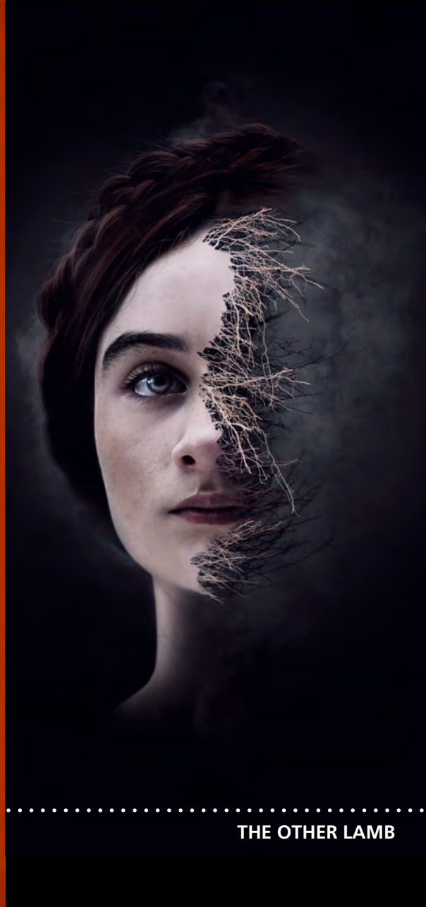
THE OTHER LAMB